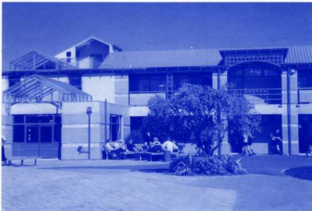
Pupils relax outside a senior common room, which is adjacent to the new science block.

Add to this the many many team results in more than 20 sports. (101 sports teams)