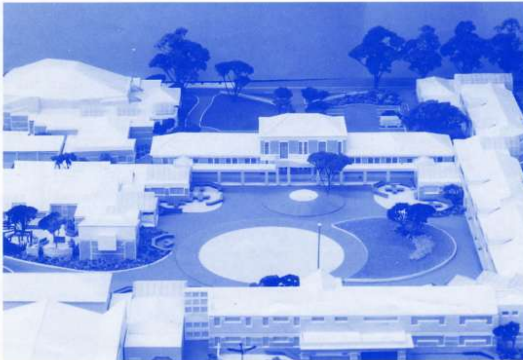
Scale model of 'New' School as prepared by Warburton Architects Ltd. Bayview Road is shown beyond the line of established trees.