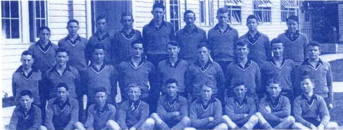
1937 5A Form photo and Movie Film: exactly the same in both

Many boys left for work at 15 after one or two years, but those still at King's appeared in the 1937 form photos and in the 1937 movie film. This is what we have to date for 5A and 5B.