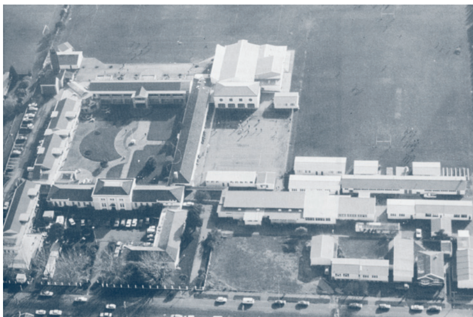
from the Westpac helicopter on the eve of the Bledisloe Cup Test 1993.