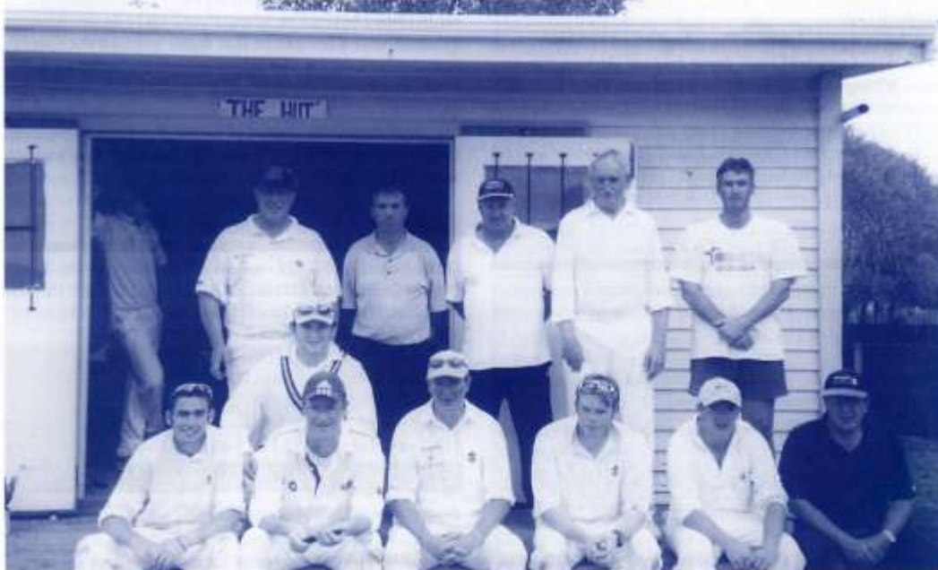
OLD BOYS XI